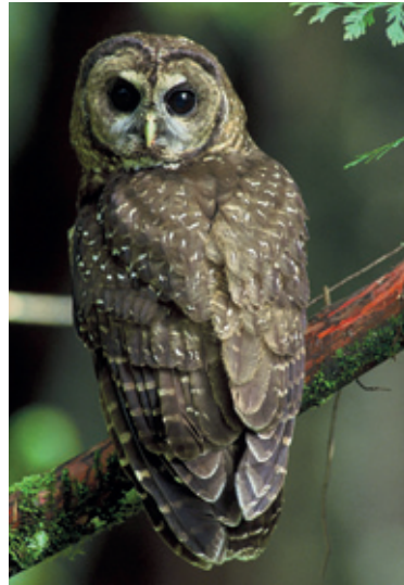
National Fish and Wildlife Service

It isn’t surprising that a large timber company would seek to accelerate logging to the detriment of endangered species, but why would the US Fish and Wildlife Service go along with their plans? Part of the answer may be that the timber company is making some pretty dramatic threats. At a Yreka, California, public meeting about the plan, an FGS representative indicated that if the company is not allowed to log most of the spotted owl habitat, then in the event of a wildfire the company would “salvage log” across the landscape and manage the forest to prevent any owl habitat from ever