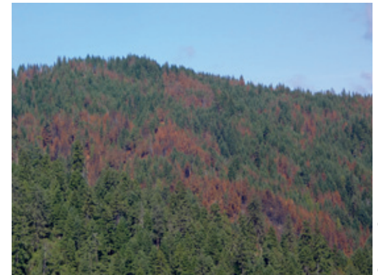
FIRE RETURNS TO THE BACKCOUNTRY: The photo above shows the result of a mixed severity burn in the 2013 Douglas Complex Fire.

We can stop throwing money and firefighters into the backcountry to "fight" wildland fires and we can redouble our efforts to create defensible space around homes and communities in fire-prone landscapes. Let's focus on collective efforts where they will accomplish the greatest good and put our shoulders to the wheel. We've got a lot of work to do.