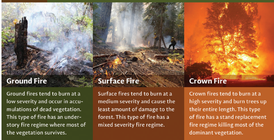
FIGURE 1 Fire Severity, Type and Regime.

For millennia, wildfires have shaped the forests of the western US, including those in the Klamath-Siskiyou region. Forests in this region are “fire-adapted,” existing for millennia with both lightning-sparked and Indigenous fires regularly burning through the landscape prior to European colonization. Historic fire severity varied, but fires often acted within the ecological system, clearing thinner trees and underbrush while maintaining older, larger trees. Burn patterns created a variety of habitat patches, contributing to a high level of biological diversity in the region.