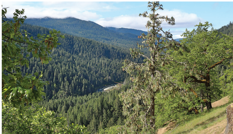
View into the Wild Rogue Wilderness.

On my Wild & Scenic Rogue trip this year, I enjoyed four beautiful days on the water with friends and got to share with them the conservation work KS Wild is doing in the Wild Rogue corridor. One of the great pleasures of my job today is advocating for the Oregon Recreation Enhancement Act, a bill that would add 59,000 acres to the Wild Rogue Wilderness while creating a new Rogue Canyon National Recreation Area. Along with