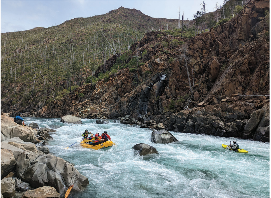
Floating down the North Fork Smith River.

benefits to the Rogue, the bill also permanently protects portions of the neighboring Wild and Scenic Illinois River from threats of toxic mining.