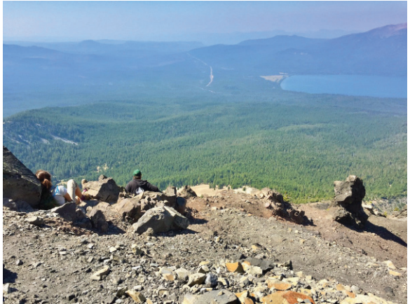
View of Diamond Lake from a Cascade mountain.

I didn’t grow up near tall mountains. After moving to Oregon I was on a day hike in sport sandals and shorts with a group heading towards a mountain with an elevation of 8,000 feet. We laughed and talked as we bounded up the trail in the dappled sunlight of the forest. The beauty and grandeur of the trees, cliffs, snow fields, and overarching blue sky took my breath away. As we got closer, I became more unsure and disoriented as I followed the others across snowfields, up to the last bit of trail crossing a steep slope of small, broken-up rocks just below steep, jagged cliff peaks.