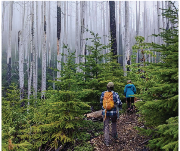
Charred snags from the 2002 Biscuit Fire tower over new growth along Babyfoot Lake trail.

After almost five years of exploring the Klamath-Siskiyou, one memory always stands out: the first time I hiked the Babyfoot Lake trail into the Kalmiopsis Wilderness. This was the first time I had seen Siskiyou Lewisia, one of my favorite Klamath-Siskiyou plants, and azalea bushes exploding with blooms. On our drive to the trailhead, I even spotted the endemic California Pitcher plant! As a plant enthusiast, my mind was blown. I felt so lucky to end up in such a biodiverse and beautiful landscape.